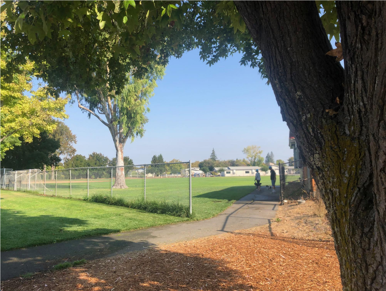
Mountain View Whisman School District